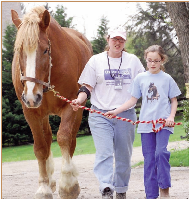
All Riders Up

NARHA's generous volunteers provided approximately 20,000 hours of donated time to the association, the equivalent of almost six full-time employees (FTEs). The dollar value for these services provided by NARHA volunteers totals more than $265,000. Without this generous support, NARHA would not be able to provide its current level of service.