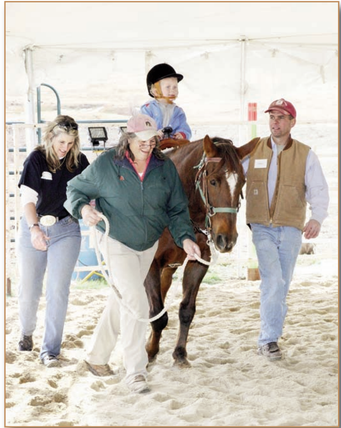
Colorado Therapeutic Riding Center, Inc.

The NARHA Riding Certification Subcommittee has revised and enhanced the education component for NARHA Registered On-site