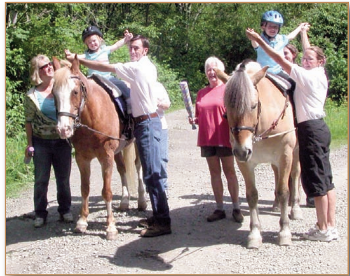
Little Bit TRC