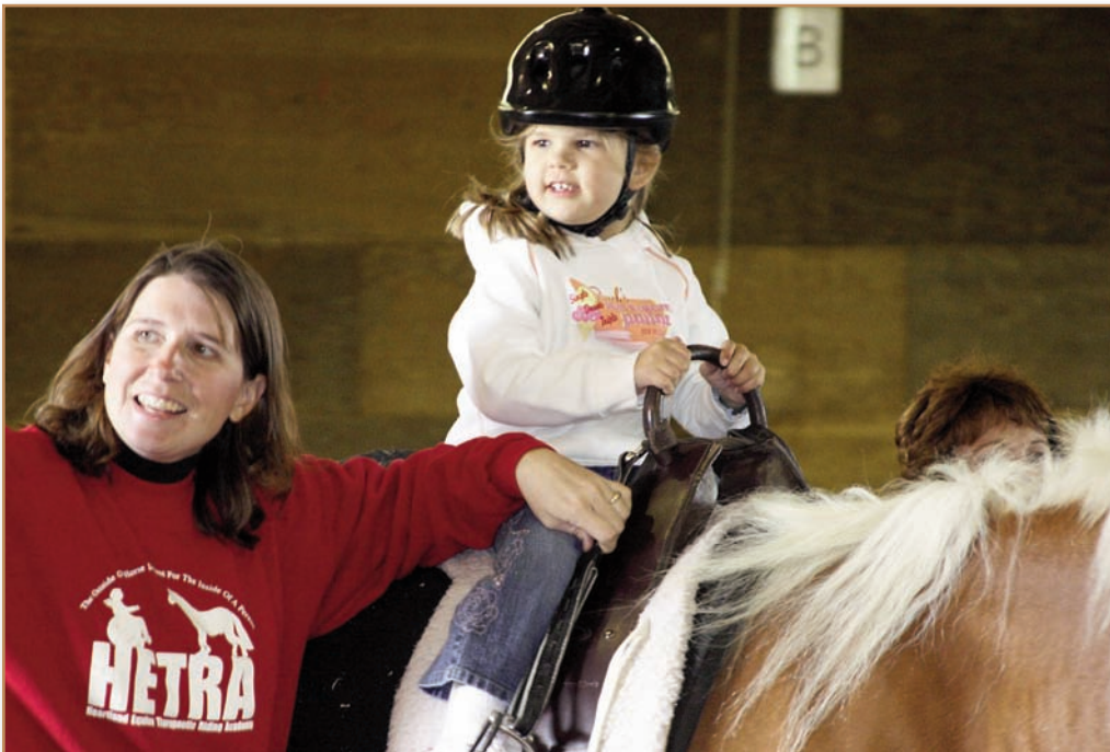
Heartland Equine Therapeutic Riding Academy

While NARHA's sponsorships remain strong, foundation support continues to elude the association. During the past 12 months NARHA has conducted significant grant research and submitted more than $1,350,000 in grant proposals. NARHA will continue to pursue grant and foundation support, efforts which the association believes will come to fruition as the economy recovers. The NARHA Board of Trustees and staff are committed to providing NARHA with the resources to pursue these efforts in a strong and professional manner.